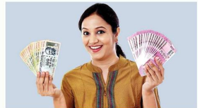
New Swarnima Scheme For Women

New Swarnima Scheme for Women: NBCFDC Loan Apply, Eligibility