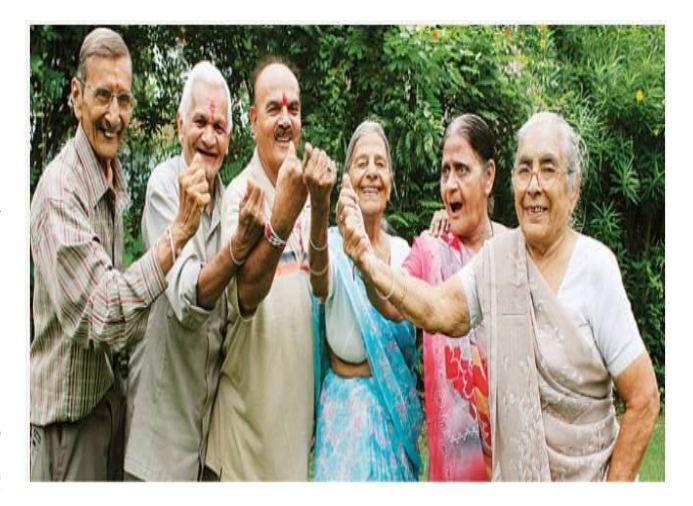
Atal Vayo Abhyuday Yojana 2023