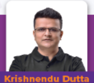
BA, MA , LLB from Delhi University

Experience: 6+ Yrs. Mentored 10,000+ Students