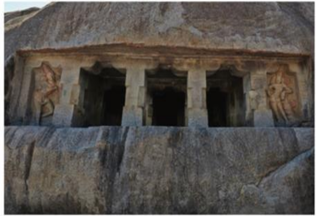
Rock-cut temple of Mahendravarman Pallava