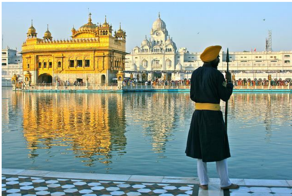
Image - Golden Temple in Amritsar