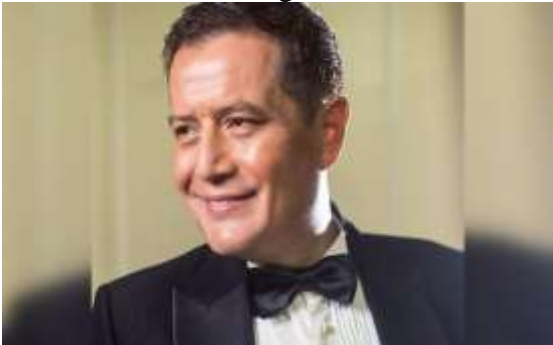
Sindhutai Sapkaal

Sindhutai Sapkaal, a social worker working for orphans, died of a heart attack. She was 75 years old. He died at the Galaxy Hospital in Pune. He had undergone a hernia operation a month ago. After that they start treatment.