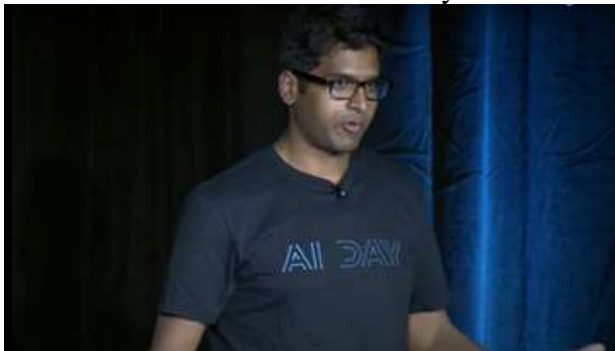
CEO of Railway Board