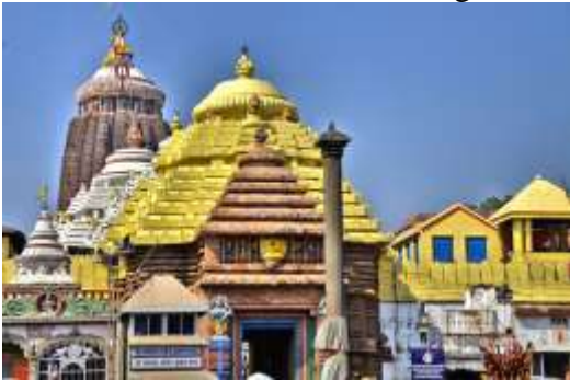
National Youth Festival