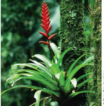
Figure 1. Bromeliad an epiphyte.