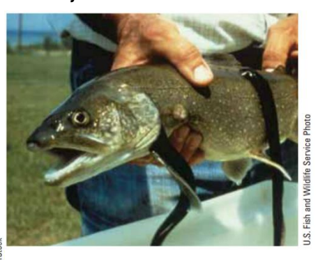
Figure 4. Mistletoe infested tree (right-side tree) and sea lampreys