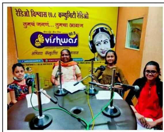
Teachers and students record lectures for 'Education for All' initiative