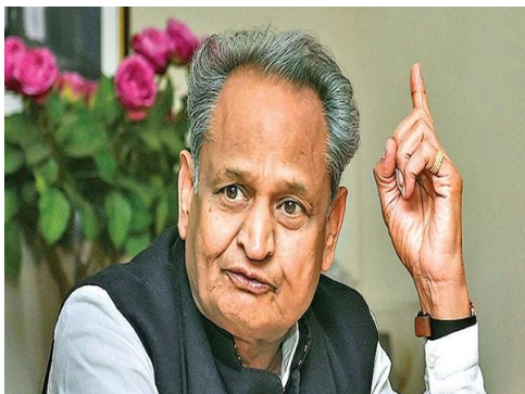
Capital: Jaipur Chief Minister: Ashok Gehlot