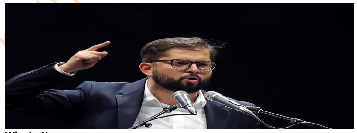
Why in News