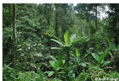
Image 1. Tirap Reserve Forest (along the Tirap River on Arunachal Pradesh border)