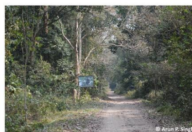
Image 2. Bhorjan Reserve Forest, near Tinsukhia Town - potential site for butterfly inclusive ecotourism